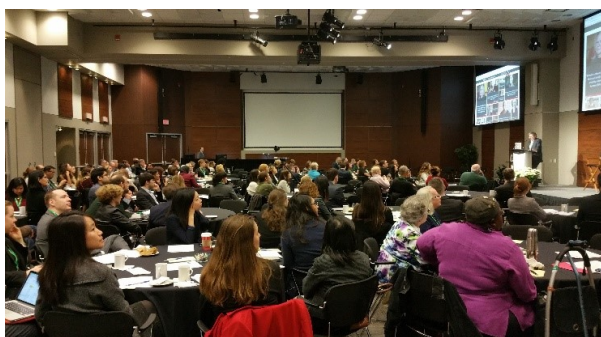
Participants at the OSSU Research Day 2016